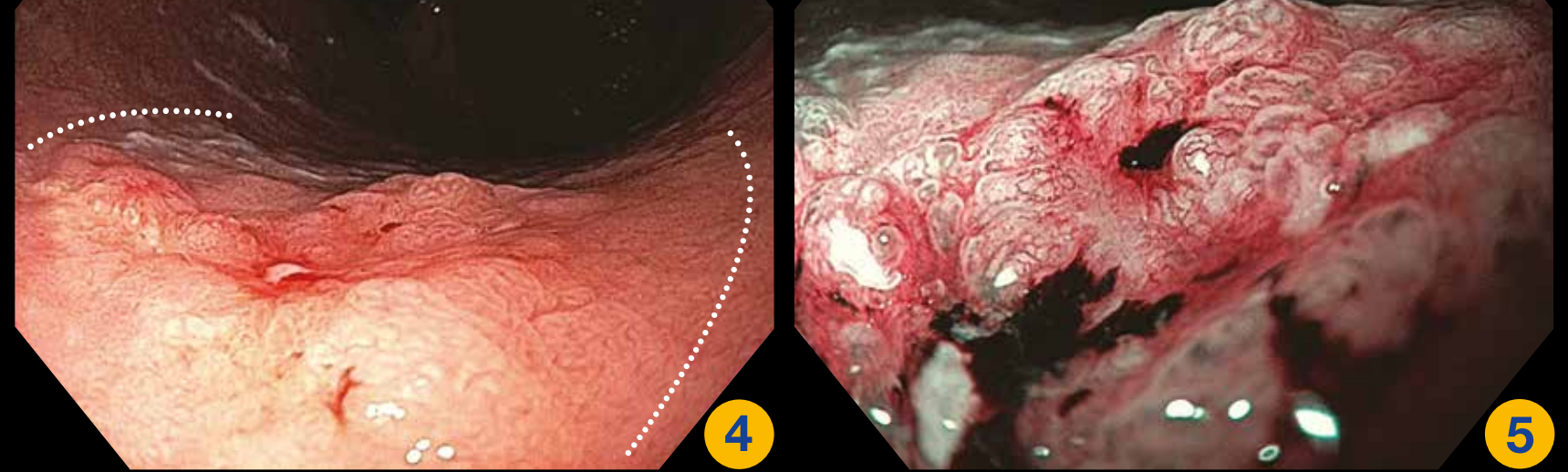
Figure 4: White light endoscopy: Depressed lesion (0-llc*) with central ulcer (0-lll*) and margin elevation (0-lla*)

Gastric cancer; a candidate for endoscopic resection